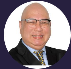
Adjunct Faculty Asian Institute of Management

To find out how you can participate, contact us at SEELL@aim.edu or visit https://go.aim.edu/seellinquiries